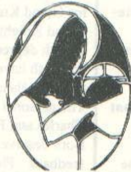
HAPPY MOTHER'S DAY