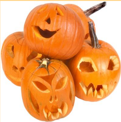
Pumpkin Carving Contest!

Saturday, October 29th 6:00pm to 10:00pm Parish Activity Center