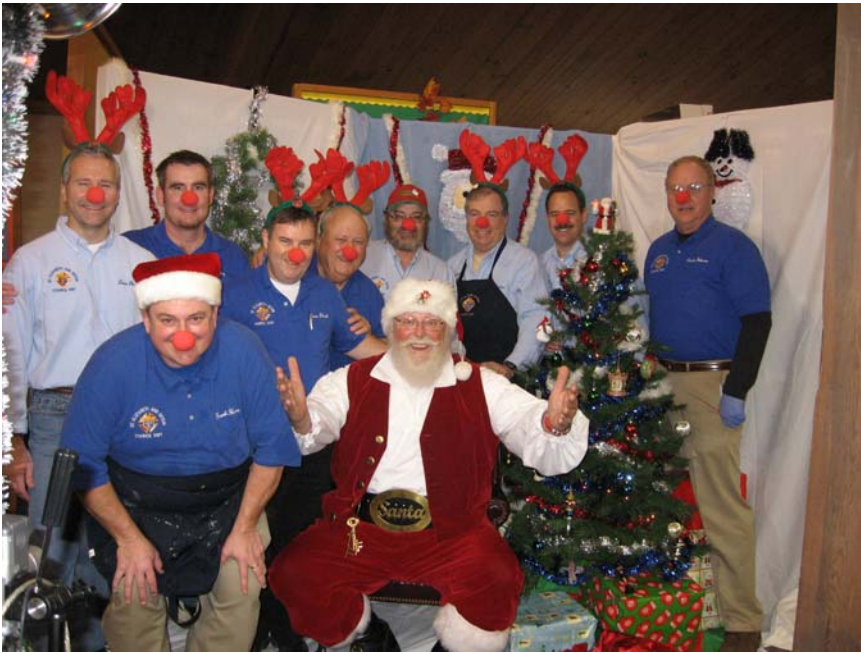
Santa and his "Helpers"