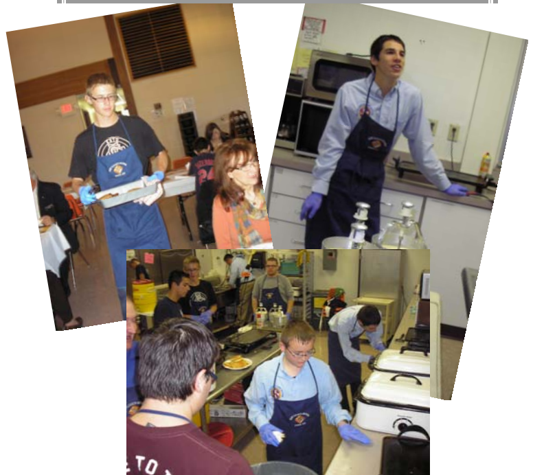
Squire's Pancake Breakfast October 21, 2012