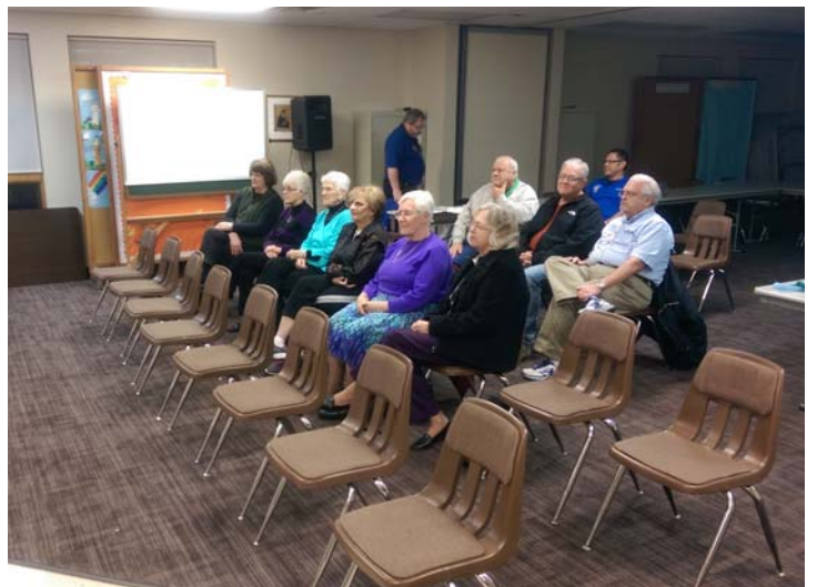
Memorial Service for departed Brother Knights