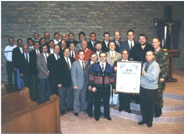
Charter Members Of St. Elizabeth Ann Seton Council 11187