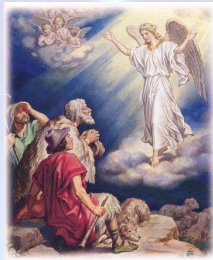
The Announcement of Christ's Birth to the Shepherds

Now there were shepherds in that region living in the fields and keeping the night watch over their flock.