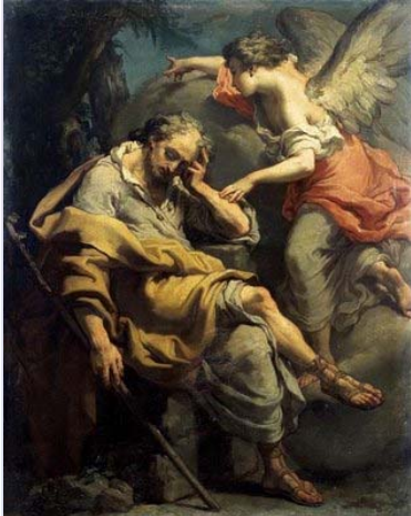
Announcement to Joseph

...the angel of the Lord appeared to him in a dream and said, "Joseph, son of David, do not be afraid to take Mary your wife into your home. For it is through the holy Spirit that this child has been conceived in her..."