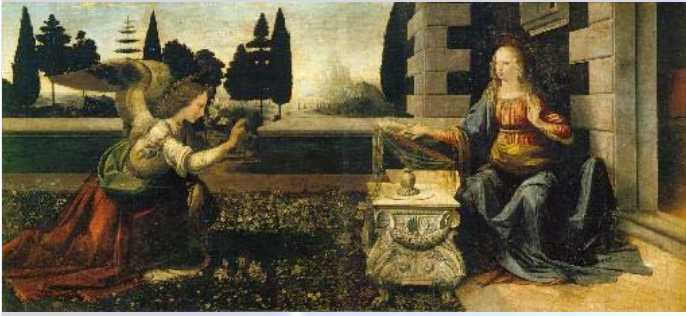
Announcement to Mary

In the sixth month, the angel Gabriel was sent from God to a town of Galilee called Nazareth, to a virgin betrothed to a man named Joseph, of the house of David, and the virgin's name was Mary.