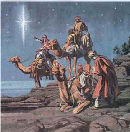
The Magi Follow the Star

Then Herod called the Magi secretly and ascertained from them the time of the star's appearance. He sent them to Bethlehem and said, "Go and search diligently for the child. When you have found him, bring me word, that I too may go and do him homage."